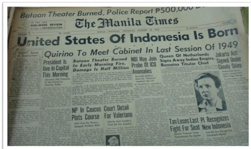
Picture 4. The Manila Times , December 28, 1949.

The same paper described the details of the recognition of the country's independence by Queen Juliana in the Netherlands. Headlined "Queen of Netherlands Signs Away Indies Empire, Remains Titular Chief" ( Manila