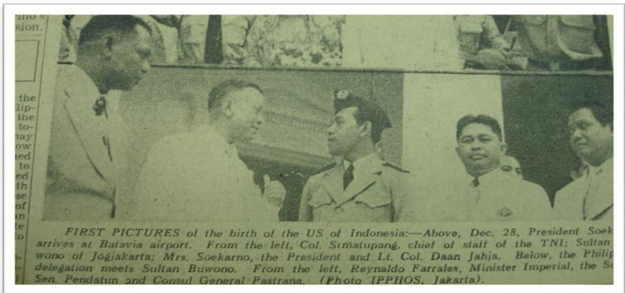
Picture 7. More photographs from the Manila Times of December 28, 1949

and hard work, to attain the true goals of which independence is the only starting point," "I am the servant of the people, not their master, he said. The crowd stayed on and cheered every phrase of his speech. "As the constitution demands, I will serve God and the people. Sovereignty for Indonesia is the beginning not the end of our history," he said. "Peace within" Sukarno country. Sukarno then said that the next goal for free Indonesians is New Guinea. "We now are peaceful terms with the Dutch and other foreigners. Show hospitality toward them," Sukarno added. Sukarno and other Indonesian leaders fought a four-year guerrilla war against the Dutch who tried to regain the archipelago after World War II. Finally, Sukarno said that everyone must work, as we never worked before. With solid unity, we must give prosperity to Indonesia and foreigners to restore our economic stability and heal the wound caused by war. God gives us peace" ( Ibid. ).